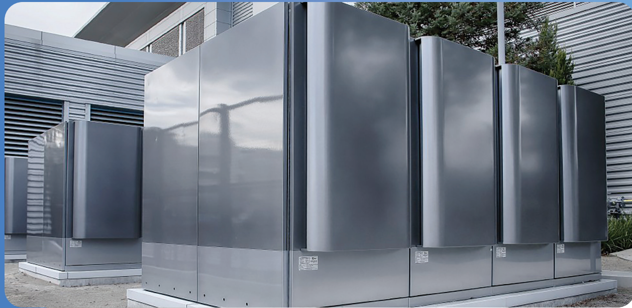
Photo: Bloom Energy Fuel Cell System. Courtesy of Bloom Energy, www.bloomenergy.com